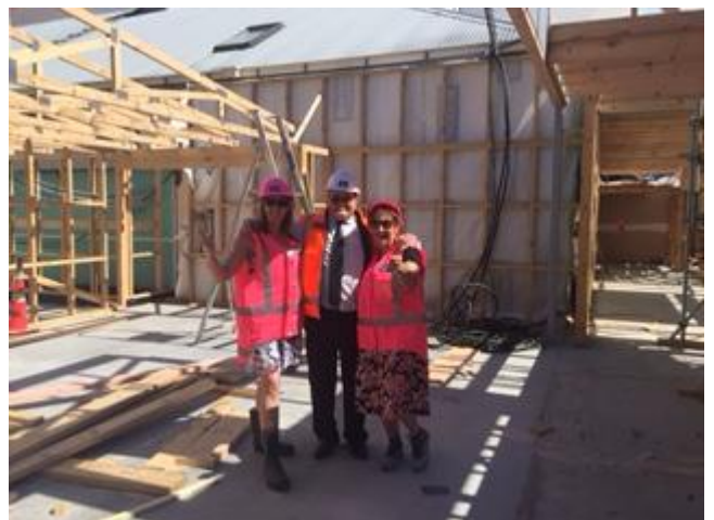
Inside Waka Puhara!