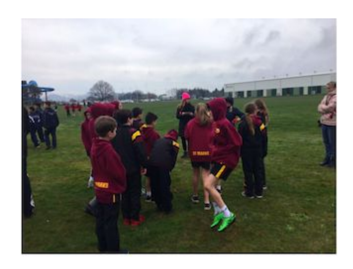
Year 6/7 Bridle Path Walk