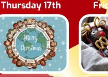
XMAS CHEF Let's make Xmas treats to share!