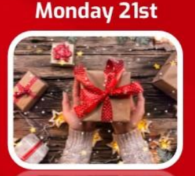
PAY IT FORWARD Pay it forward today, we're making giftsto give.