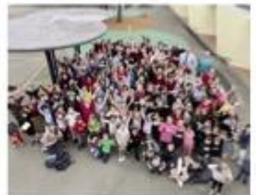
Photo following last years St Mark's School Fountain of Peace NZ Walk with a Purpose event

Website - https://www.fountainofpeace.org.nz